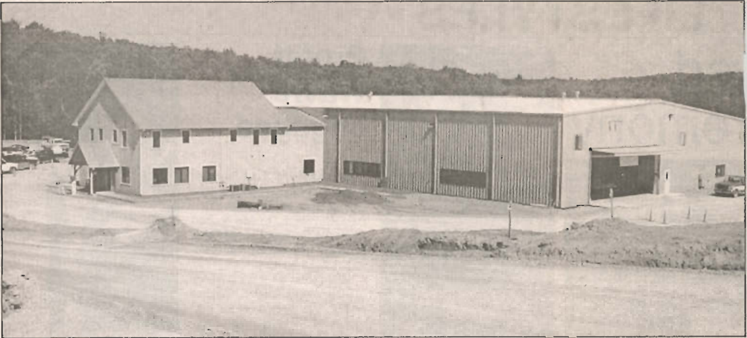
Dreaming Creek's 23,000 square foot manufacturing facility and 4,225 square foot timber frame office sits on an 11-acre tract at the Park.